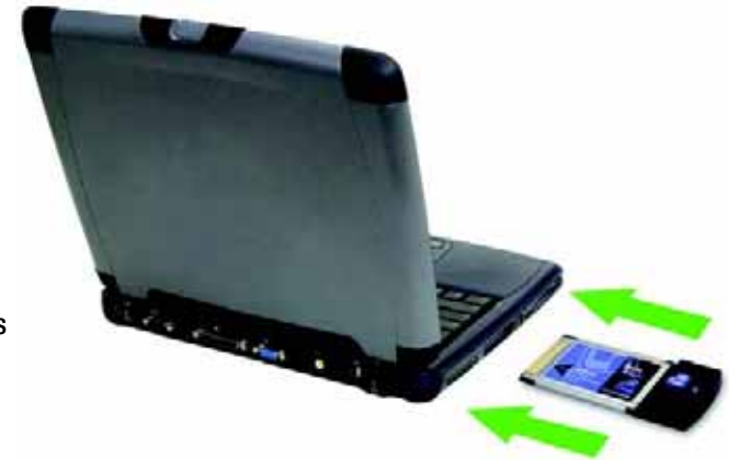
Figure 5-1: Installing the Adapter into your notebook

If you want to check the link information, search for available wireless networks, or make additional configuration changes, go to “Chapter 6: Using the Wireless Network Monitor.”